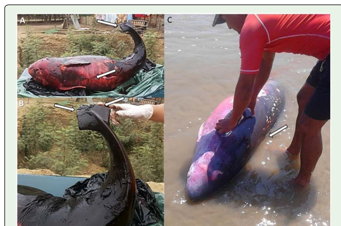
Figure 3: Specimens of dwarf sperm whales ( Kogia sima ) showing mutilation of fins. A-B) dwarf sperm whale exhibiting lack of caudal fin, which was systematically cut in two portions and removed (white arrows) and marks of entanglements by gillnets on the body (white arrow); this individual was found in the Puerto Lopez (Manabí Province) in July 2014; and, C) juvenile male of dwarf sperm whale missing the dorsal fin found in Crucita (Manabí Province) in August 2015.

and wounds inflicted by a predator were not found in any of the dead specimens.